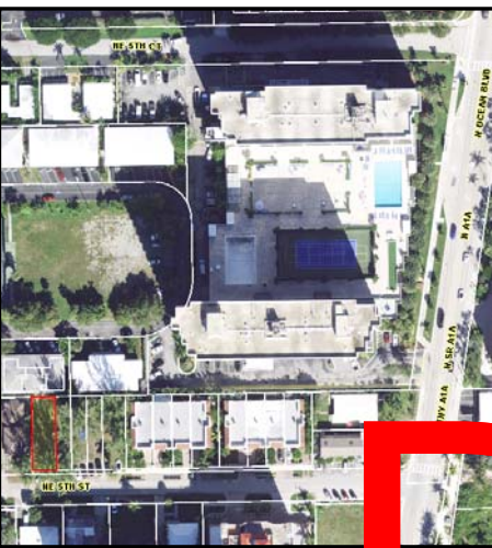
AERIAL MAP (NOT TO SCALE)

FLOOD ZONE INFORMATION Community No. 120055 Panel No. 0377 Suffix: L FIRM Date: 09-11-2009 Flood Zone: AE + 5'